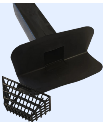
Trims & Fittings