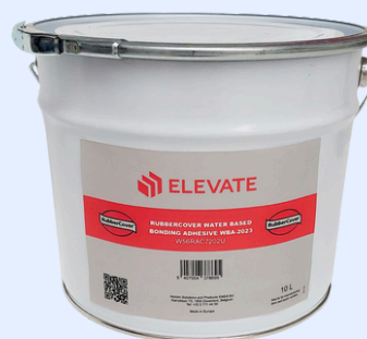
Adhesives & Sealants